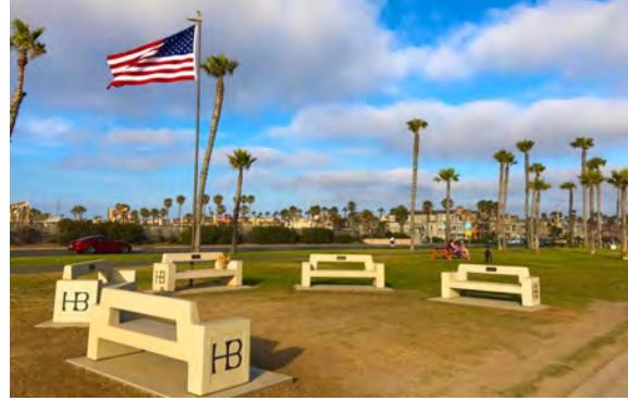
Above left: The flag's original location; Right: The flag's new location, at Patriot Point