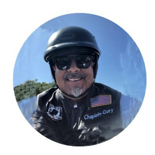
Rider's/Sons Chaplain Corner