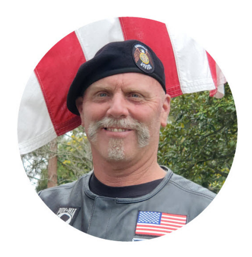
Legion Rider's Corner