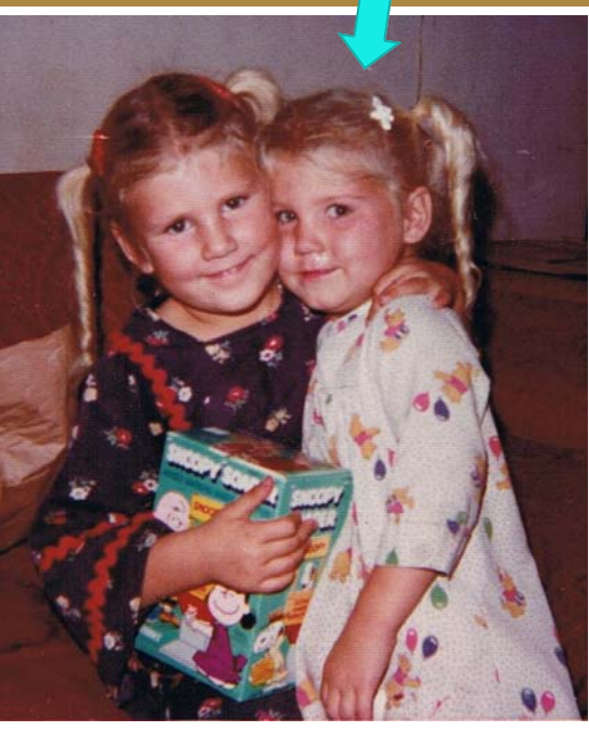
Previous months' Blasts from the Past:

Featured member & family are not eligible for the free drink. :)