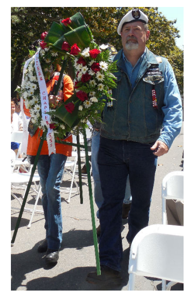
Setting the Chapter Wreath at 2014 Memorial Day Service