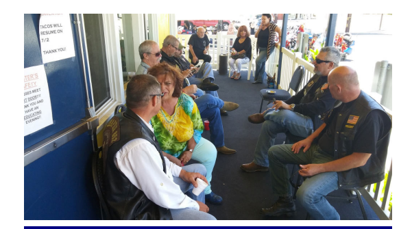
After Meeting Socializing