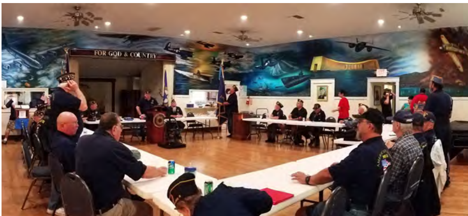
Above: Sacred Ground is the area inside the boundaries of the tables.

There is no hard rule on the precise boundary of Sacred Ground, which means that it is open for each Legion Post to honor the Sacred Ground as each Post sees fit. At Post 555, the sacred ground is the area bordered by the tables at which the membership and officers are seated.