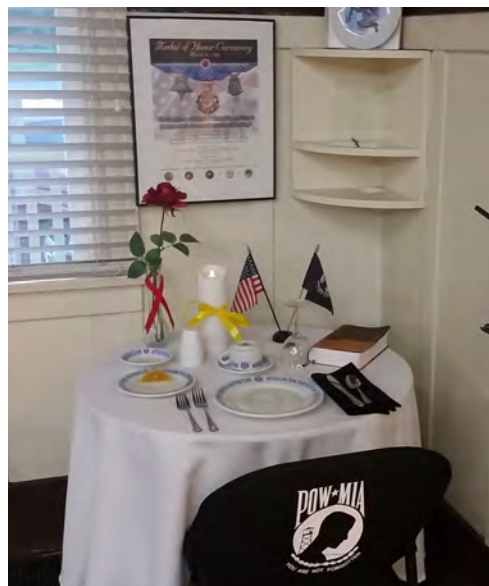
Above: The POW / MIA Table as displayed at Post 555

The lighted candle reflects the light of hope which lives in our hearts to illuminate their way home, away from their