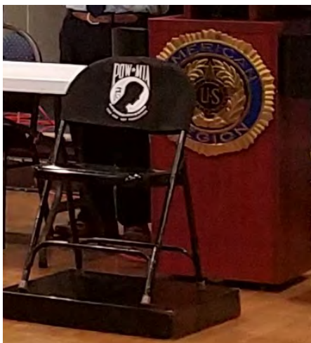
Above: The POW / MIA chair as displayed at any official meeting