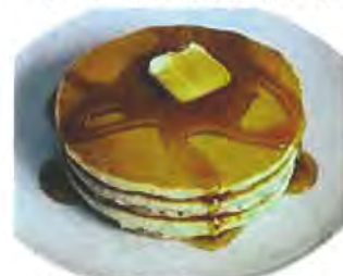
Proceeds benefit Boy Scout Troop 4 First Presbyterian Church of Westminster

DATE: Saturday, July 28, 2018 WHEN: 8:00 AM to 12:00 Noon WHERE: American Legion on Beach Blvd 14582 Beach Blvd, Midway City, CA COST: $5 for Breakfast Per Person