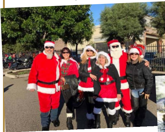
Santa Ride to Orangewood Children's Home