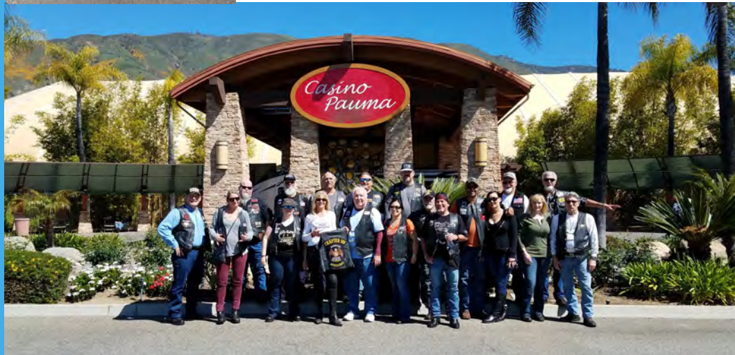
Lower Left: Scenic shot from the Lame Duck Ride. Bottom: Riders pose for a family portrait after brunch, Casino Pauma.