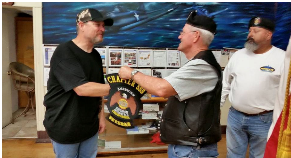
Chapter 555 Keeps Growing