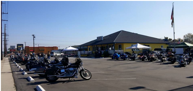
Area 5 President's Meeting