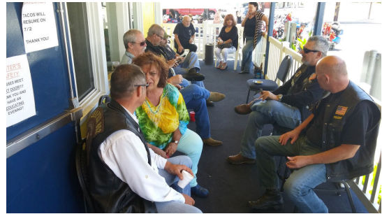
After Meeting Socializing